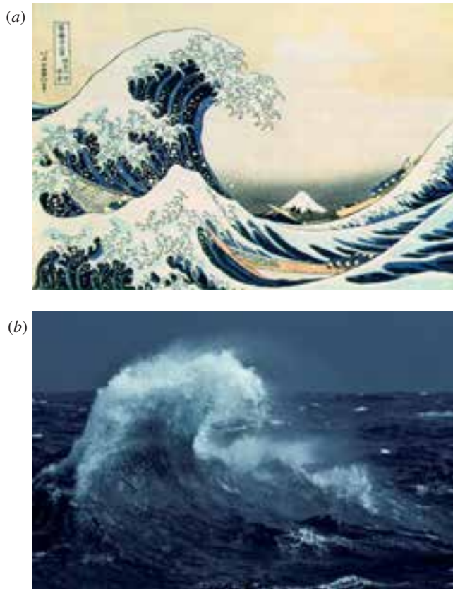
Figure 1. Comparison of Hokusai's Great wave with an observation in sub-Antarctic water. (a) The great wave off Kanagawa ( Kanagawa-oki nami-ura ) woodcut by Katsushika Hokusai. (b) Photograph of a breaking wave in the sub-Antarctic waters of the Southern Ocean taken from the French research vessel Astrolabe during one of its regular voyages between Hobart and the Dumont d'Urville Station in Adélie Land. Note the transverse and longitudinal localization of the wave, which is remarkably similar to that depicted by Hokusai. (Online version in colour.)

average values of other ocean waves in the surrounding environment. It is important to distinguish rogue waves from tsunamis. 2 A rogue wave is a strongly localized wave in space and time on the ocean's surface, whereas a tsunami is caused by massive water displacement. After their initial stage of generation, tsunamis propagate at high speed over long distances at small amplitude, typically as low as tens of centimetres on the open ocean, where they are generally unnoticed. Tsunamis only become destructive as they run up to the shore and grow to great height as the water depth decreases.