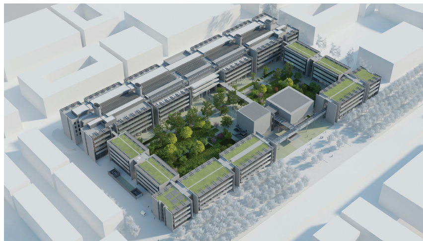
The new ENS Paris-Saclay building designed by Renzo Piano and his team is planned to open in 2019