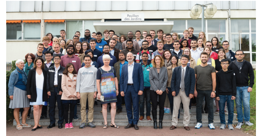
International students – promo 2017-2018